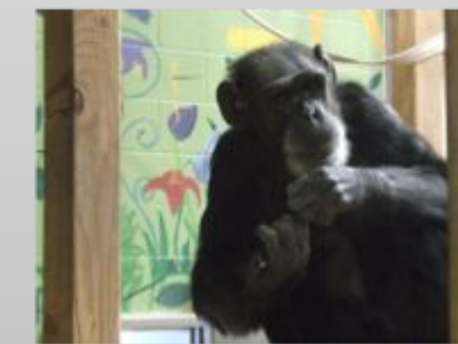
Tatu signs rice